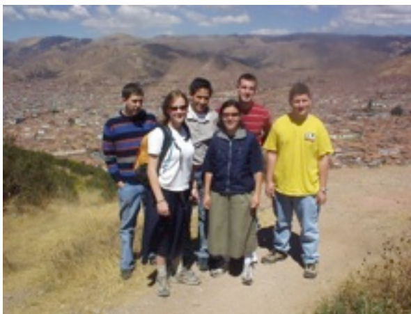
Students in La Paz, Bolivia During Missions Internship

The internship program will be served in a local church, under an approved veteran pastor. The student will be assigned tasks and given instruction by the local church pastor. Each day will be filled with diligent study and practical service, and the student will be exposed to real-life applications of ministry.